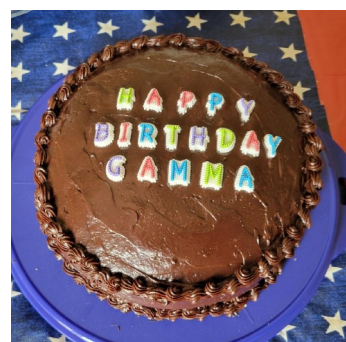
This celebratory cake was enjoyed at the chapter's annual birthday lunch meeting in June.