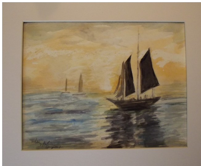
"Outer Harbor - Inner Light"

Liz Biglin shared a watercolor painting she created based on a friend's photograph . (photo by Liz Biglin)