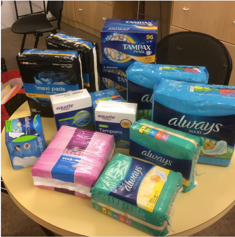
[Above] Feminine Supplies donated by Gamma members at the February Meeting