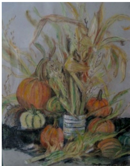
Pumpkin Art (Photo of painting by Dr. Liz Biglin. Used with permission.)