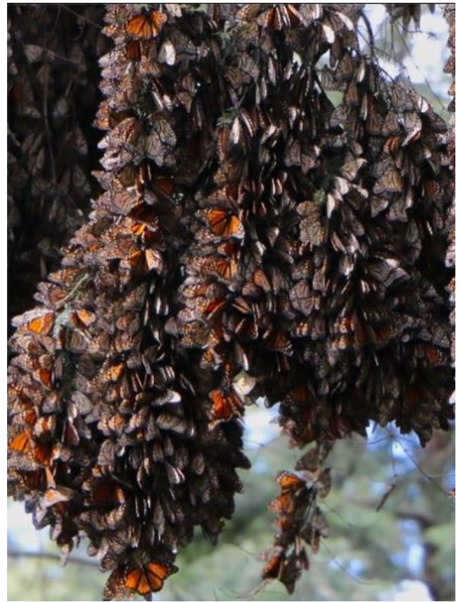
Top-left Clusters of Monarch butterflies winter in Oyamel Fir trees in the mountains of Mexico.