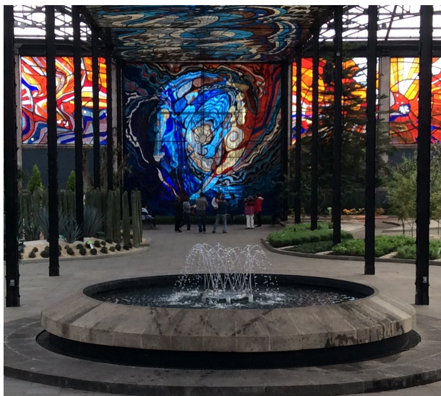
Stained glass at the Botanical Gardens in Toluca, Mexico.

REMEMBER WE ARE ON THE WEB AT GAMMAOHIO.COM